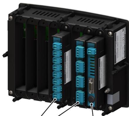
Up to 7 plug-in input and output interface modules

Documentation and support are extensive including instruction manuals for the display, CODESYS software and each of the plug-in modules, plus videos and application guides. CODESYS runtime is a well known industry standard software package. Demonstration systems can be viewed at the BEKA sales office and at some BEKA agents. Loan systems are available for evaluation and programme development.