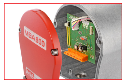
Selectable parameter sets