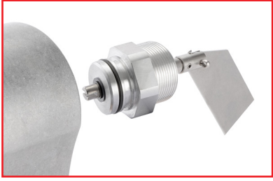
Device head can swivel and be pulled off